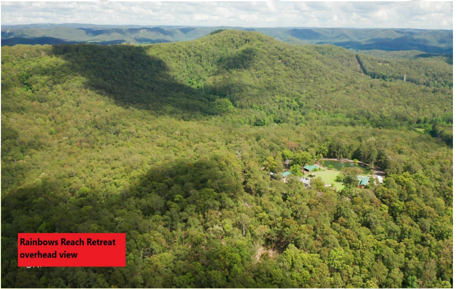
Rainbows Reach Retreat overhead view